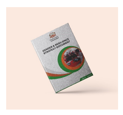
Wajir County Gender and Resilience Strategy, 2017 CIS Document. Click Here

This document was developed with considerable support from BRACED and it lays out a vision "To create a gender responsive, resilient County where human rights are upheld and women, men, boys and girls have equal opportunities to participate in the development process" (WCGS, 2017).