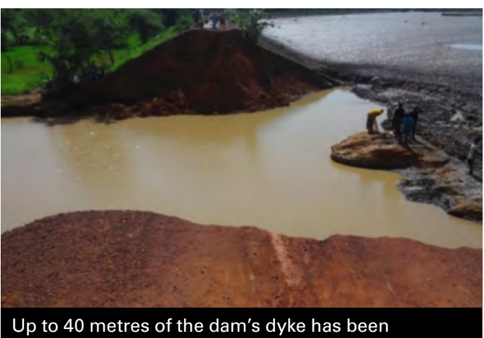
Up to 40 metres of the dam's dyke has been destroyed following the floods.

The availability of cereals and vegetables will be greatly affected by these losses in this period of harvest.