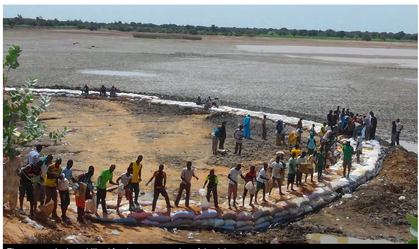
The community is mobilised for the reconstruction of the dyke.

In the meantime, the people of Bogandé have mobilised to fill a portion of the destroyed dyke with the resources available to them. The Provincial Directorate of Social Affairs and National Solidarity of Gnagna has been able to provide emergency aid. Food, hygiene kits (consisting of buckets, soap and kettles), tents and mosquito nets have been distributed to affected families, but these allocations have not been able to stretch to cover everyone who has been affected by the floods. Vital needs are yet to be fulfilled and the government has called for support from donors and NGOs, launched by the National Council of Emergency Relief and Rehabilitation (CONASUR) for all the flood victims.